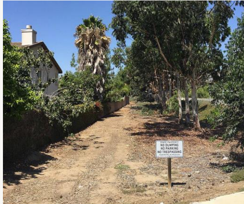
Segment adjacent to homes and toll road.