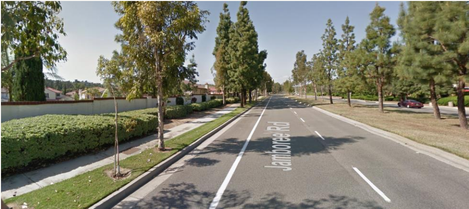
Segment adjacent to homes.