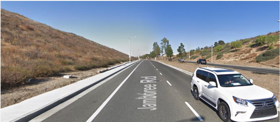
Segment adjacent to open space along Jamboree, looking north.