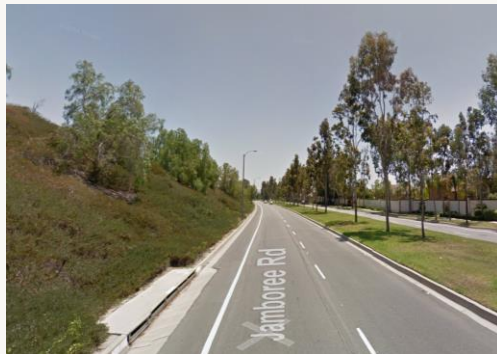
Segment adjacent to open space along Jamboree, looking south.